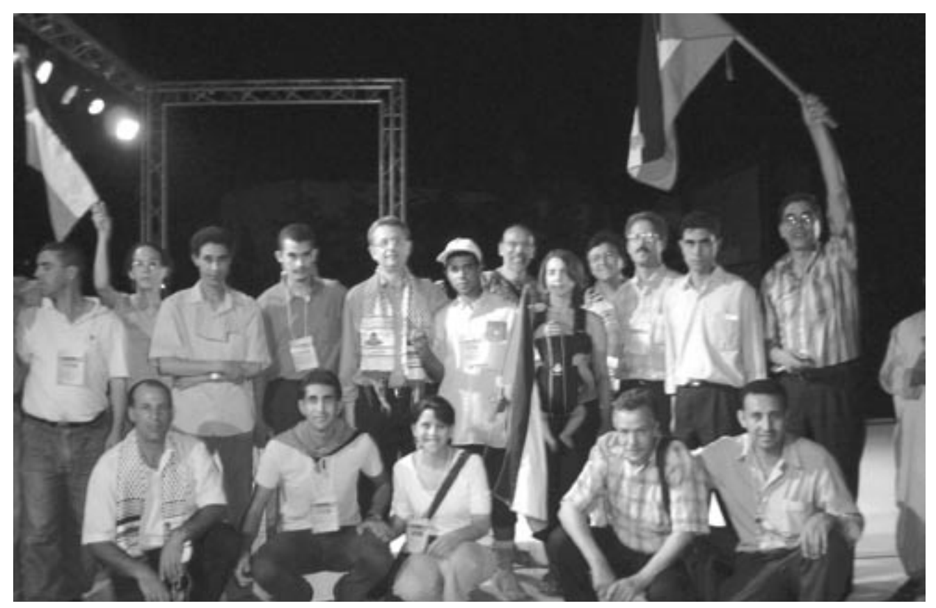
Activities from various arab countries during the opening of the second Morocan Social Forum, 27-29 July 2004