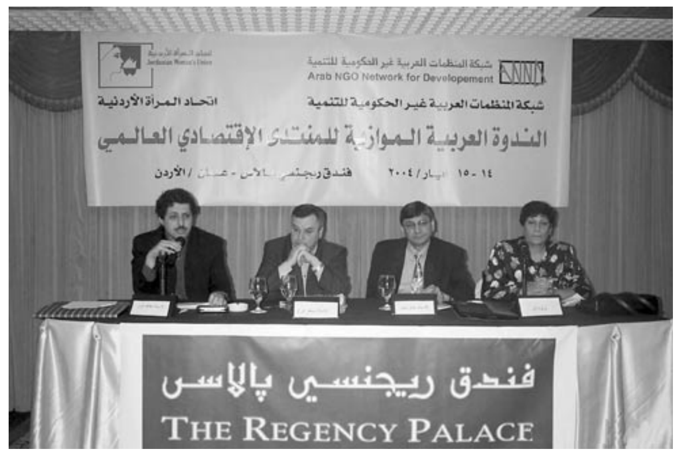
Regional Similar parallel to the World Economic Forum in Jordan, 15-17 May 2004